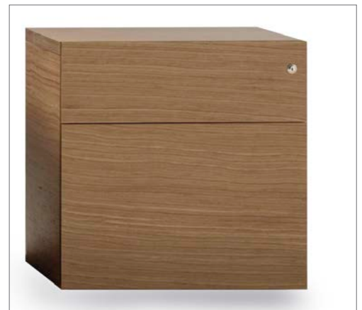
Drawer + file drawer