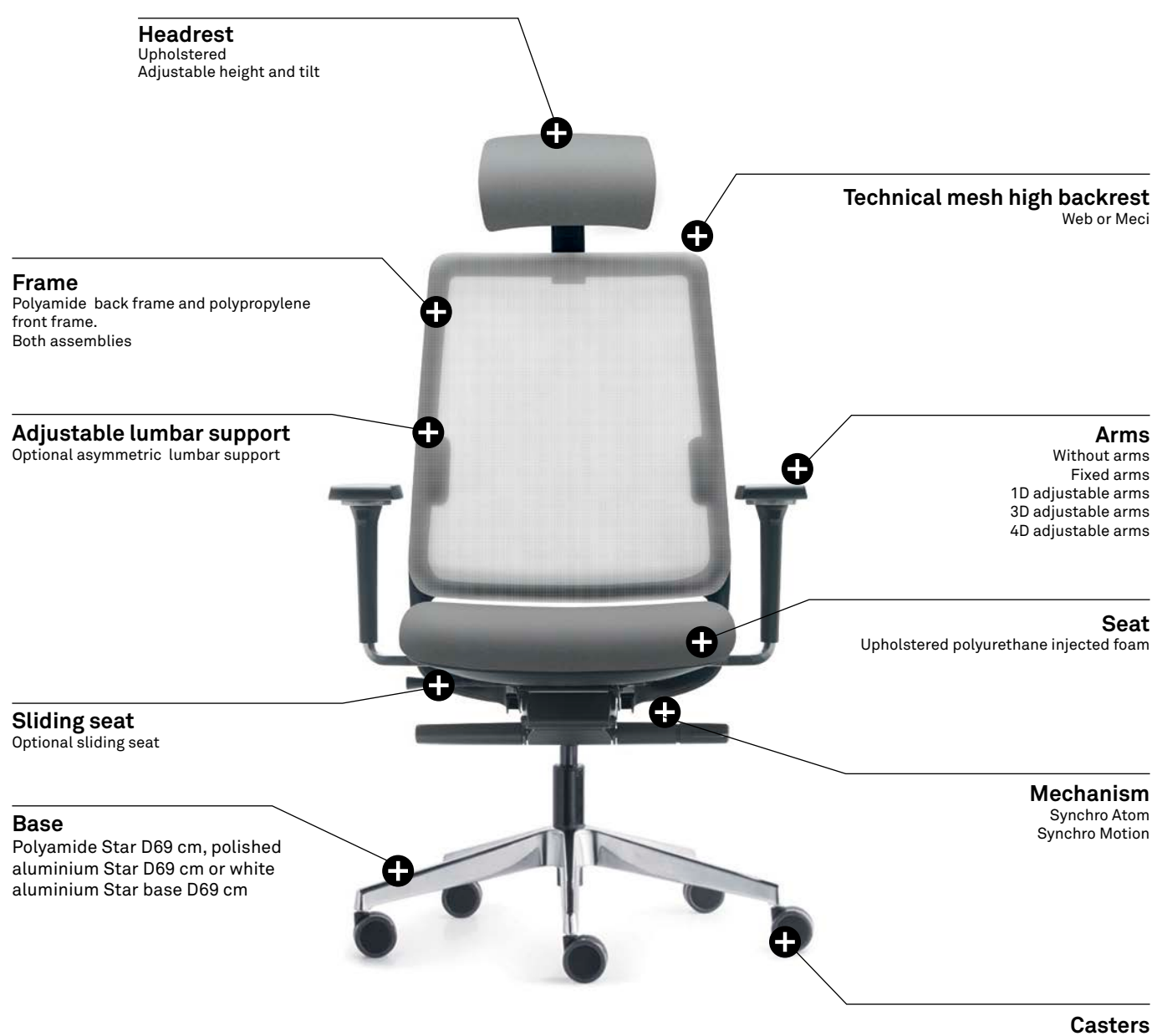
Standarddouble wheel casters Soft double wheel casters